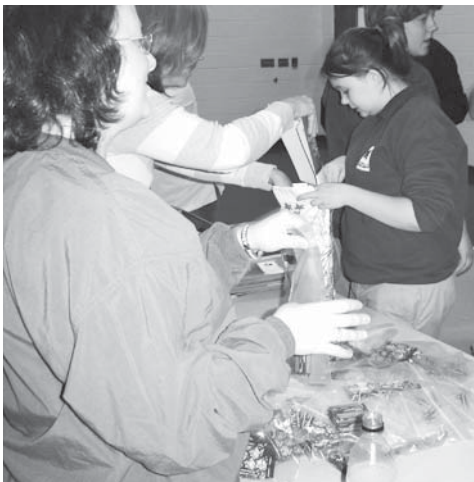
Students and teachers prepare packages for soldiers serving in Iraq.

Enthusiastic about reaching out to the soldiers, each of the 156 students currently served at Ramey Estep prepared a gift package. Each package consisted of personal toiletries, selected food items, and a personal letter from the student. As a special touch, students included specially designed stationary sets and a Christmas card so soldiers could write to loved ones back home. Items included in the packages were donated by staff at REHS, Ashland Community Technical College, and Holiday Inn Express. Ramey Estep Homes also donated a large amount of food items. Packages were mailed to the soldiers on Veteran's Day.